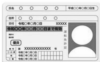
Standard Driver's License Only