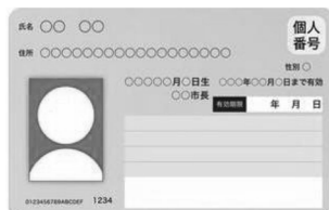
My Number Driver's License